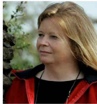
(c) Nuala Ní Dhomhnaill – Taibhsí i mBéal na Gaoithe

(dance workshop, crafts e.g. Saint Brigid crosses, writing in ogham, writing in seanchló, etc.)